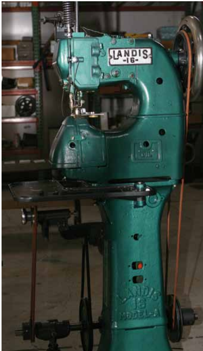
Rebuilt Landis 16

COST for a basic rebuild is something like $3,500-$4,000 but a "super deluxe" package can run a bit more. Just depends on what you want done.